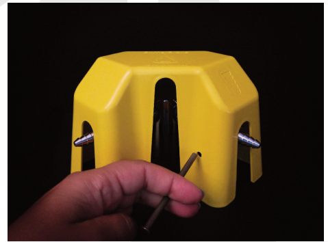
With Removable Fastener