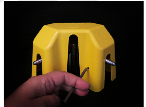
With Removable Fastener